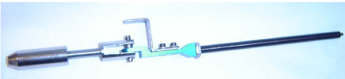
Figure 2: Assembly of the armature and the thin threaded rod. The armature at the left of the image fits inside a solenoid.